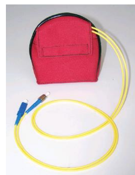
Available in Pelican Cases and Soft Pouches